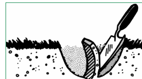
Figure 3. Soil sampling with a trowel.

Push the handle forward, with the spade still in the soil to make a wide opening. Then, as shown in Figure 3, cut a thin slice from the side of the opening that is of uniform thickness, approximately \frac{1}{4} inch thick and 2 inches in width, extending from the top of the ground to the depth of the cut. Collect from several locations. Combine and mix them in a plastic bucket to avoid metal contamination. Take about a pint of the mixed soil and place it in the UGA soil sample bag. Be sure to identify the sample bag and the submission form before mailing.